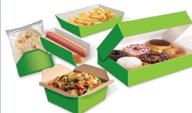
Foodservice • QSR • Bakery