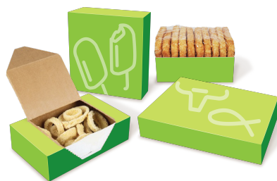
Frozen + Prepared Foods

ULTRA-VERSATILE market segment applications for products requiring direct board contact.