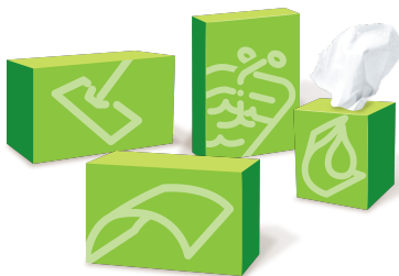
Homecare + Household Cleaning