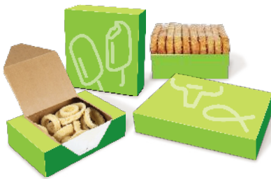
Frozen + Prepared Foods

ULTRA-VERSATILE market segment applications for products requiring direct board contact.