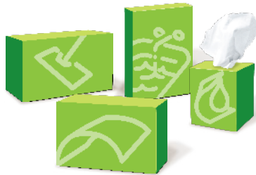
Homecare + Household Cleaning