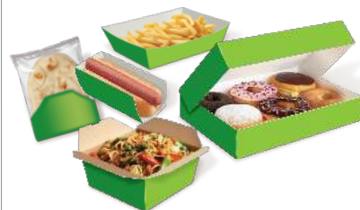
Foodservice • QSR • Bakery